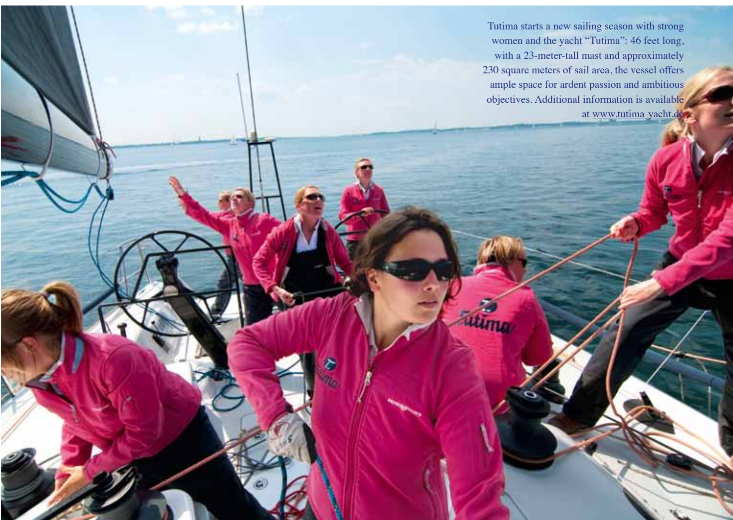
Tutima starts a new sailing season with strong women and the yacht "Tutima": 46 feet long, with a 23-meter-tall mast and approximately 230 square meters of sail area, the vessel offers ample space for ardent passion and ambitious objectives. Additional information is available at www.tutima-yacht.de