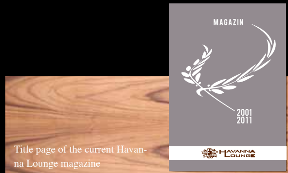
Title page of the current Havana Lounge magazine

"OUR PROFESSION IS TIME, BUT OUR WATCHES ARE TIMELESS."