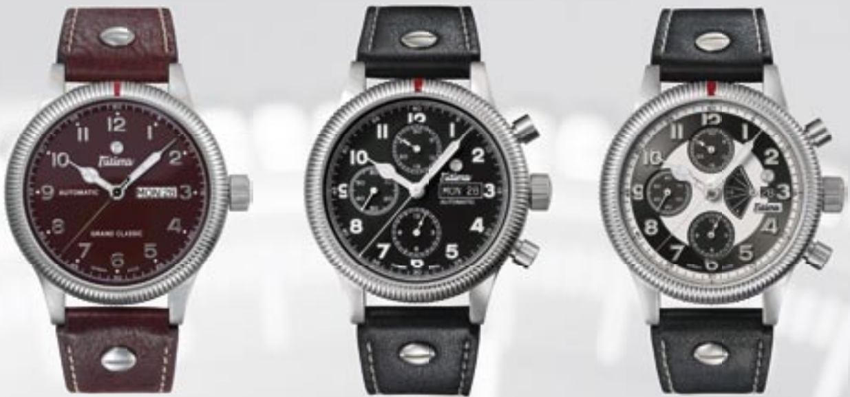
Grand Classic Automatic, Ref. 628-05: classic Tutima with 43-mm diameter, brown dial, leather strap.