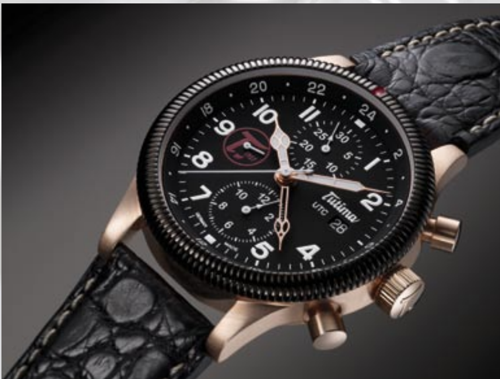
Grand Classic “Alpha”, Ref. 789-01: limited edition of 100. Ceramic bezel, 18 karat rose gold case and bracelet clasp, UTC function (second time zone).

With a case diameter of 43 millimeters, this watch turns time into a true experience. The Grand Classic “Alpha” by Tutima is a safe investment in the future. Produced as a limited edition of 100, the watch has a solid 18 karat rose gold case with rotating ceramic bezel and Valjoux 7754 mechanical chronograph movement.