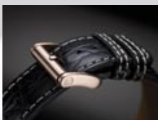
18 karat rose gold bracelet clasp.

In addition to the standard chronograph functions, the self-winding Valjoux 7754 movement also shows “coordinated universal time”, internationally abbreviated as UTC.