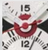
Grand Classic, Ref. 781-04: chronograph with “co-ordinated universal time”, internationally abbreviated as UTC, (second time zone) and stainless steel bracelet.