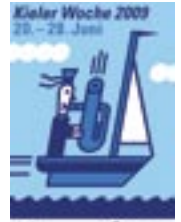
Official timekeeper at the 2009 Kieler Woche regattas

More than 70 percent of the international X-yacht crews plan to return to Kiel! The 2009 Kieler Woche regattas (June 20 to 28) will be a veritable "X-Festival". For the second time since 2007, the X-35 class championships will take place in Kiel, and the X-41 class will stage its first European Championship as part of the Kieler Woche. Tutima is title sponsor of both these yachting highlights.