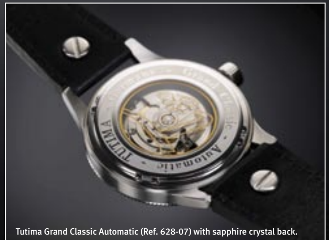
Tutima Grand Classic Automatic (Ref. 628-07).