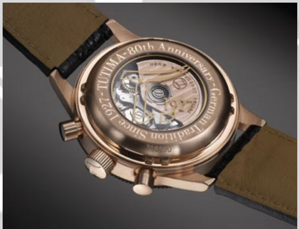
Screw-down case back of Grand Classic Alpha (Ref. 789-01) with sapphire crystal featuring Tutima “T” and 1927, the year of foundation.