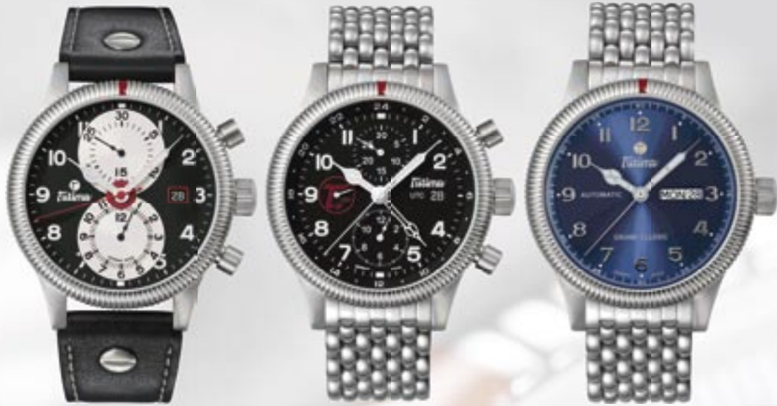
Grand Classic, Ref. 781-05: chronograph with large 30-minute and 12-hour counters, stopwatch.

One of the striking features of all the models in the “Grand Classic” series is the sapphire crystal back engraved with the large Tutima “T” and the figures 1927, which stand for the year in which the history of Tutima began, when the UROFA (Uhren-Rohwerke-Fabrik Glashütte AG) and UFAG (Uhrenfabrik Glashütte AG) companies were founded in the watchmaking town of Glashütte in Saxony.