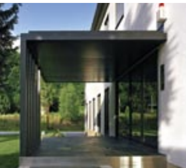
The Tutima building in Glashütte.