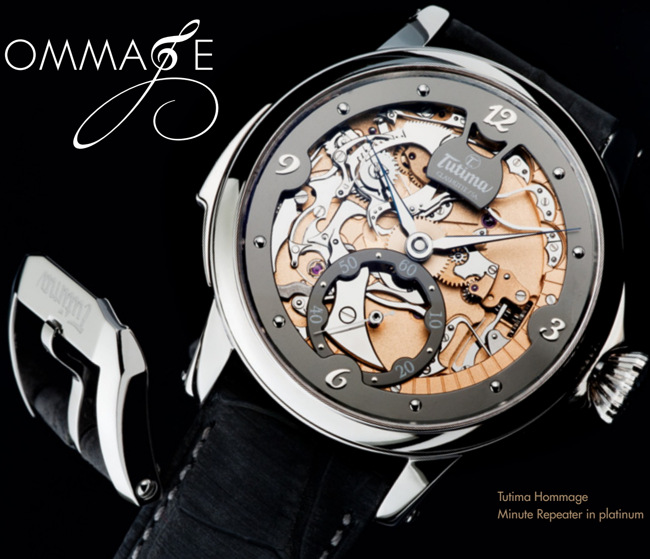
Tutima Hommage Minute Repeater in platinum