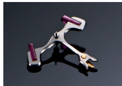
Steel pallet lever with domed surface