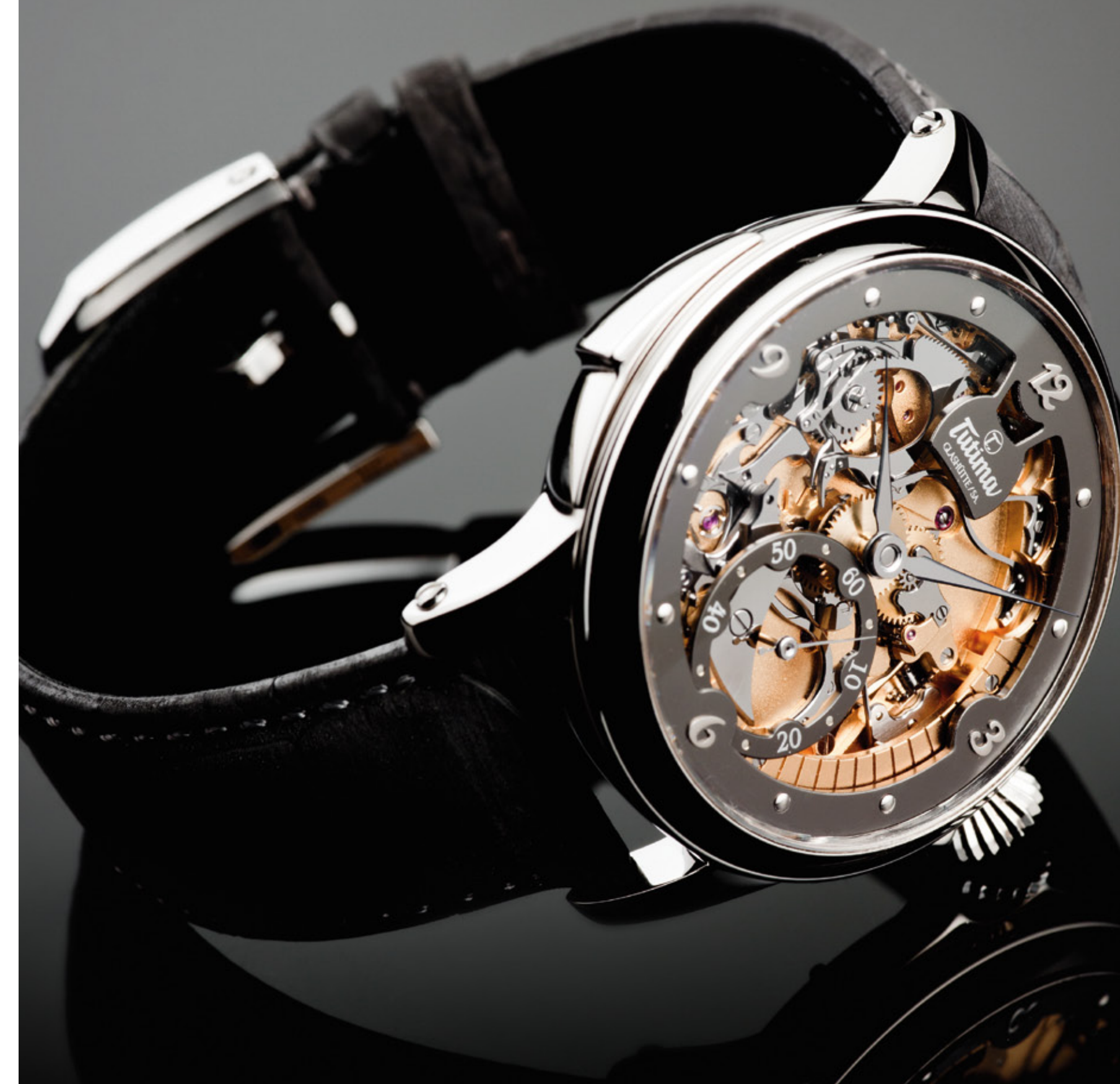
Tutima Hommage Minute Repeater in platinum with open dial

A FASCINATING COMBINATION: THE PRECISION OF A PREMIUM TIMEPIECE TEAMED WITH THE ESTHETICS OF A UNIQUE WORK OF ART.