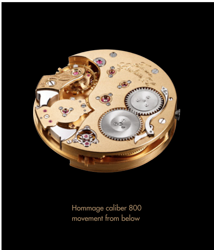
Hommage caliber 800 movement from below