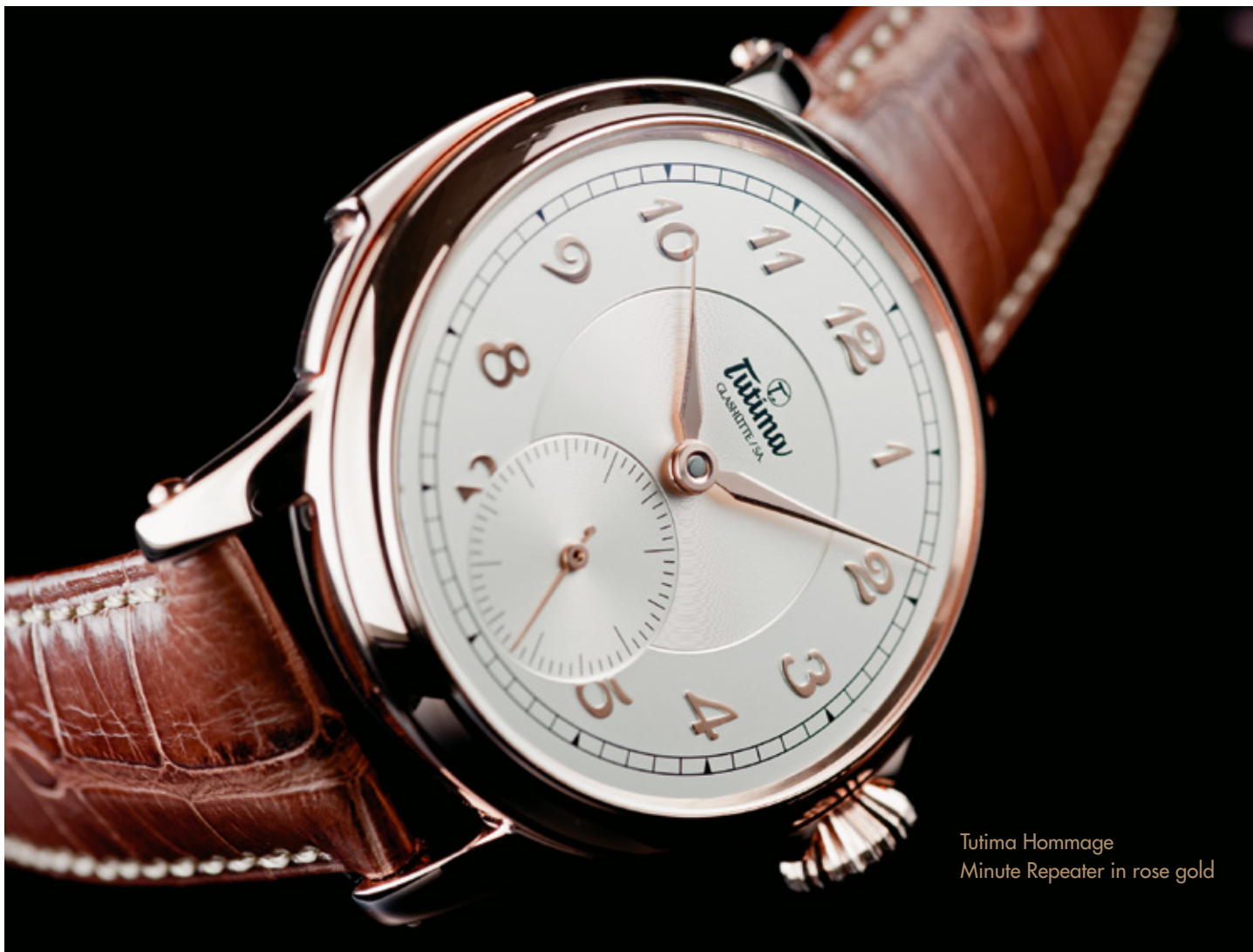
Tutima Hommage Minute Repeater in rose gold