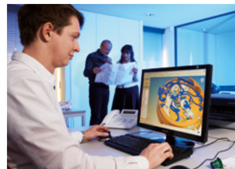
Computer aided design