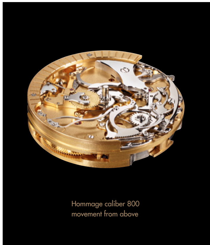
Hommage caliber 800 movement from above